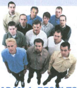
ADAM 1: RESULTS