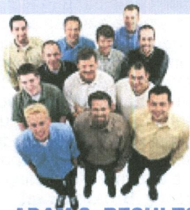
ADAM 2: RESULTS